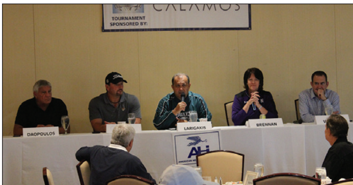
Sports panel discusses important topics in today’s news.

AHI hosted its Fourteenth Annual Golf Classic at Belle Haven Country Club, Alexandria, Va., Oct. 16, 2017. Fifty-four golfers participat-