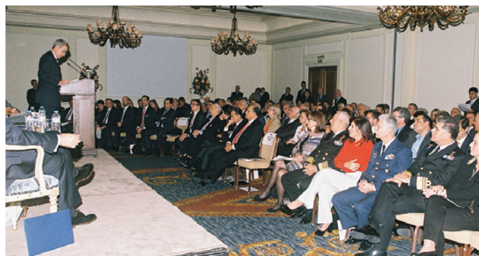
View of attendees.