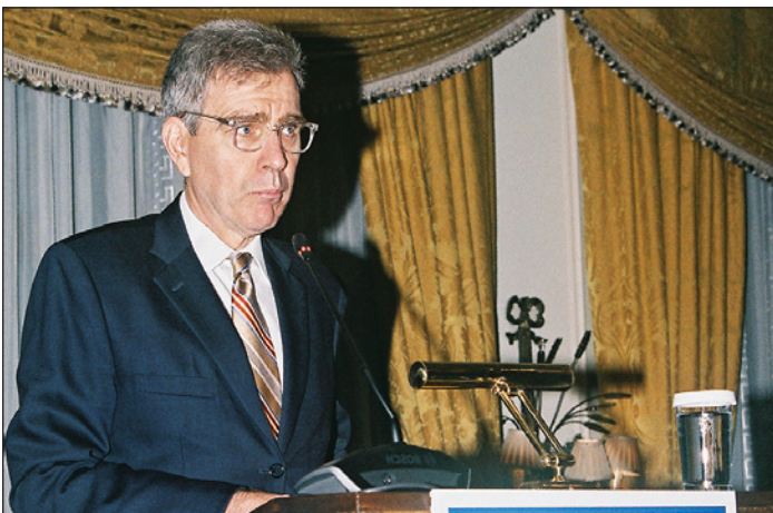
Ambassador Geoffrey Pyatt, U.S. Ambassador to Greece presents the Keynote Address.

AHI hosted a panel presentation featuring U.S. Ambassador to Greece Geoffrey Pyatt as keynote speaker, Nov. 29, 2017, at the Hotel Grande Bretagne, Athens, Greece. Ambassador Pyatt, and four panelists, which included Greece's Deputy Defense Minister Dimitris