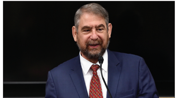
Cypriot Ambassador Leonidas Pantelides.