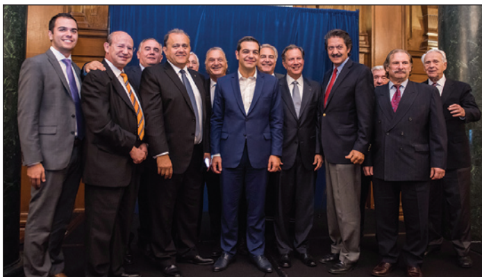
AHI members share a moment with Prime Minister Tsipras.

Prime Minister Tsipras described members of the community as the best ambassadors, and added, "You represent the values of freedom and democracy."