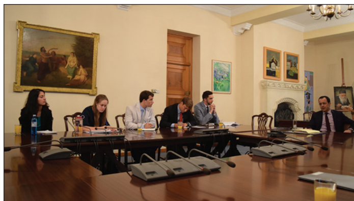
Nicos Christodoulides, Cypriot Government Spokesman briefs students at the Presidential Palace.