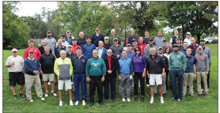
14th Annual AHI Golf Classic participants.