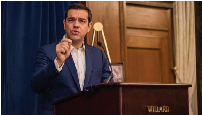
Prime Minister Tsipras delivers remarks.

Continental, Washington, D.C. Prime Minister Tsipras was in the midst of a five-day visit to the United States, which included a meeting and joint press conference with President Donald J. Trump, Oct. 17.