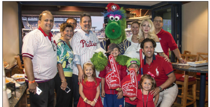
The Phillie Phanatic visits the VIP Suite to entertain the fans.