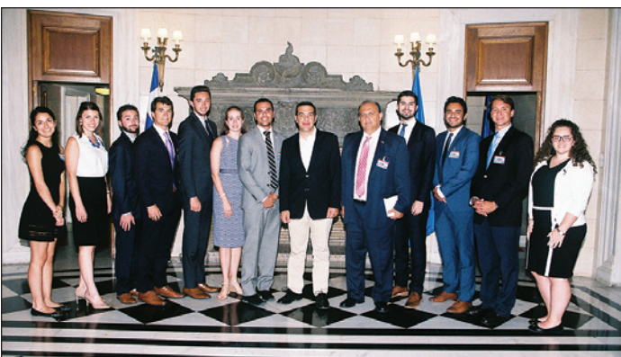
Prime Minister Alexis Tsipras with the students at the Megaro Maximou.