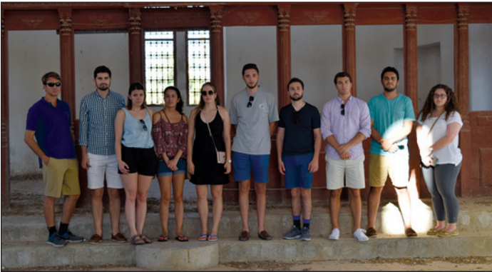
A desecrated Orthodox Church in the Turkish occupied area.