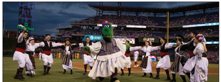
The Pan-Macedonian Dance Group dancing around The Phillie Phanatic on the field during the 5th Inning.

AHI organized its Fourth Annual Greek Heritage Night held in cooperation with Major League Baseball’s Philadelphia Phillies, June 20, 2017, at Citizens Bank Park, Philadelphia, Pa. Approximately 600 persons from the Tri-State Philadelphia area were in attendance to see the Philadelphia Phillies take on the St. Louis Cardinals.