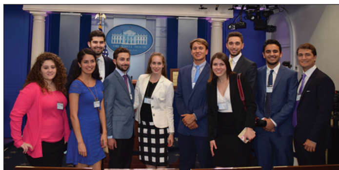
White House Press Briefing Room.